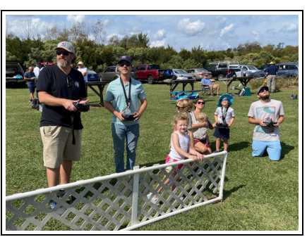
People of all ages can learn to fly.