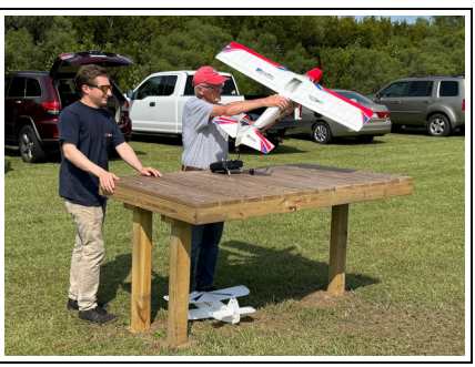
Preparing a model plane for flight.